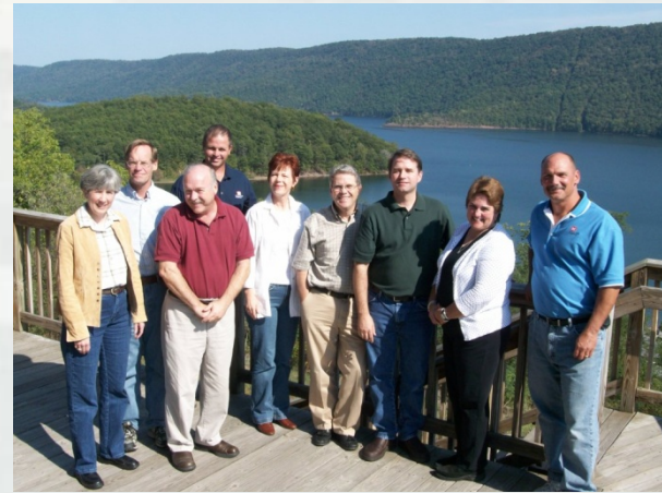
PAC 2009 – Raystown